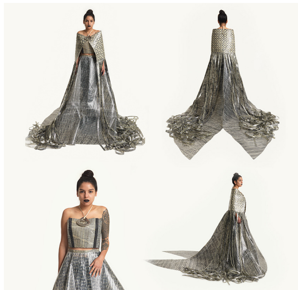
Figure 6: Final design outcome, Voyager project.

our entry was selected for the World of WearableArt shows in Wellington, at a later stage to be exhibited in the WoW museum in Nelson (Figure 6).