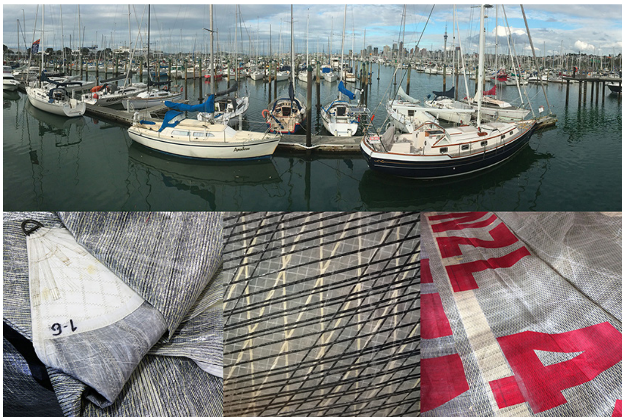
Figure 1: Auckland's main marina and images of competition sails.

sails have been made in New Zealand since the early 1980s, but an increasing number are acquired from China. Regardless of the country of origin, the high number of regattas in New Zealand results in large stockpiles of used sails still in reasonable working condition.