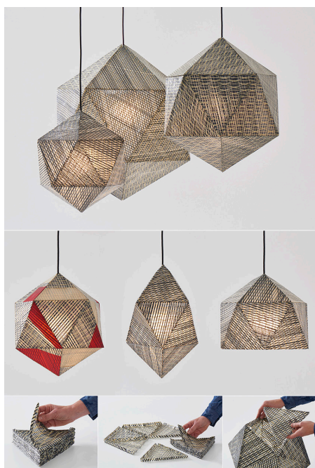
Figure 4: Final design outcome, Navigator project.

Our final design outcome is called Navigator , referring to the use of stars while sailing to new lands. The product is intended to be shipped to the consumer flat-packed, in a small cardboard box containing a stack of triangles with connecting magnets and a metal clamp to hold the lampshade in place on the electrical cord of an existing ceiling pendant. Assembly is done by the consumer, which reduces manufacturing costs and shipping volumes, helping in turn with the commercial viability of the product. Self-assembly was also chosen because a product that incorporates a creative or 'making' component promotes a greater emotional attachment, adding to its longevity. The triangular pieces can be arranged into different shapes, and single pieces can be replaced if necessary, also adding to the lifespan of the product (Figure 4).