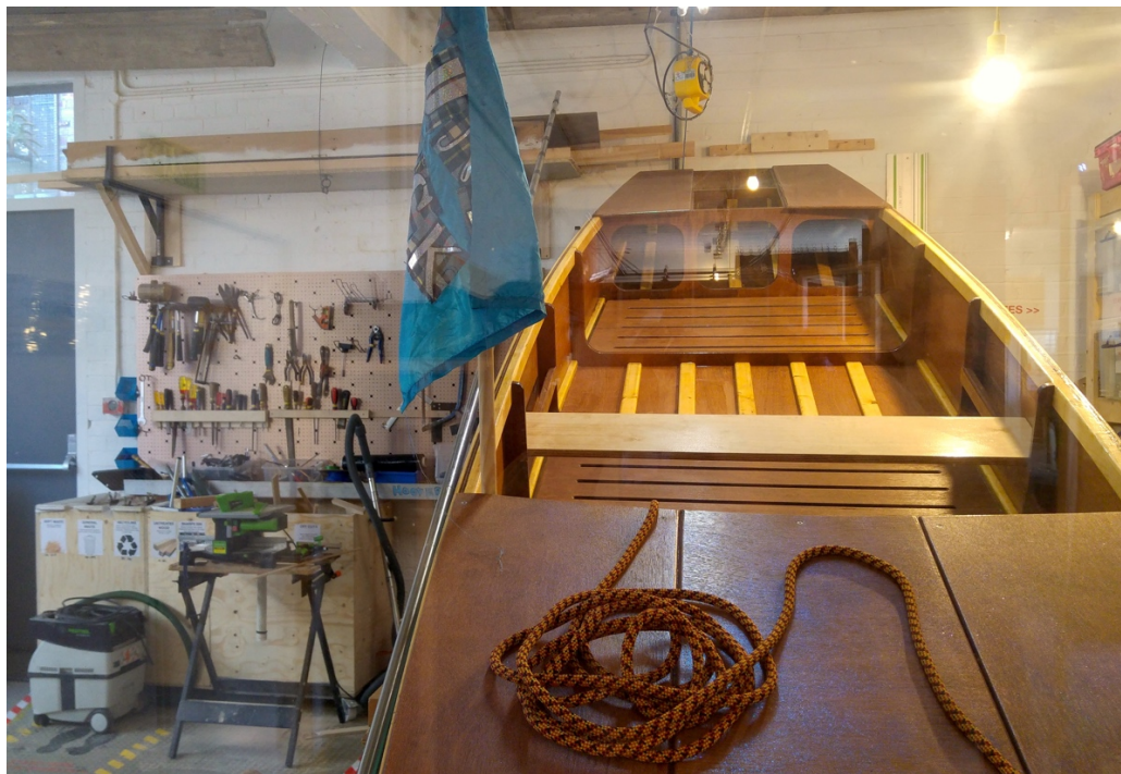
The assembled punt manufactured with digital fabrication technologies at Machines Room, London.

Punts are small wooden boats traditionally associated with the River Thames in England. In 2016, the second author met Ross Andrews, a makers-in-residence at the East London-based makerspace Machines Room. His work on the punt had been included in Machines Room's exhibition 'Fix the City, curated for the 2016 London Design Festival. Being involved in the local boat community, he was interested in finding ways to connect the traditional craftsmanship and attitude of the local boat community with the perceived novelty of digital manufacturing technologies and practices. The punt project he worked on was a suitable fit, as it involved constructing the whole boat from scratch instead of using digital fabrication technologies for the conservation and repair of an old one. The starting point was a blueprint of a punt designed by a friend's grandfather in the 1940s. The plan required a translation into a digital format appropriate for a machine to execute it. Embracing the DIY/do-it-together (DIT)-ethos of the makerspace, he first learned by himself how to create a 3D-CAD model with SketchUp from the blueprint. This was then followed by learning the steps of the CAD/CAM-pipeline to produce the punt parts with the help of the maker community.