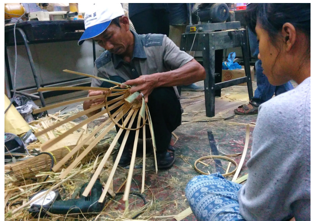
Figure 3. Craftsmen working on early prototypes, Digital Bamboo Studio, ITB Bandung.

The responses were broad; some personally focussed, some more social, for use in domestic and personal spaces. The material narratives varied from those that notably privileged the 'analogue' qualities of bamboo, to others that offered a more technological perspective. Different strategies were used to achieve aesthetic cohesion between what may be considered disparate materials, particularly the contrast of raw 3D printed plastic and bamboo. Some groups exploited the functionality of 3D printing but hid its materiality. Some found a visual and tactile balance between the two. Others reduced the visibility of bamboo or transformed it in ways that repositioned its strong symbolic properties. Despite the variety of approaches, the work demonstrated cohesion and distinctive material and processual characteristics.