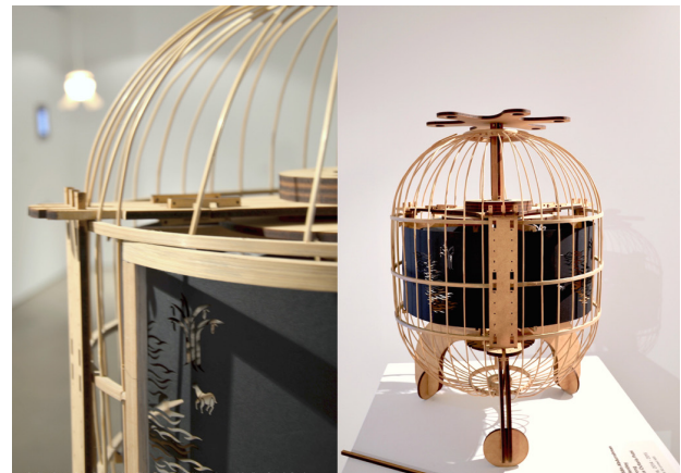
Figure 5 . The Ceritera storytelling projector lamp.

The original prototype called on traditional crafting methods: a direct process of splitting, expanding and tying a single piece of large bamboo. 3D printed and laser cut components were used for the projection winding mechanism, but were hidden from view. The limitations of this design soon became obvious, the focal length of the projection requiring the positioning of the animation cut out a distance from the light source that could not be met using curved inter-nodal arcs of bamboo. The second prototype adopted a bamboo bird cage construction technique where design limitations were less limited by the production technique. It was constructed as a series of flat pack components created by Indonesian craftsmen and digital fabrication devices, shipped to Australia for assembly. This approach permitted the desired functionality, but also necessitated a reconsideration of the visual and material language. The final 'Ceritera' work (Illustration 2) expresses a greater degree of geometric precision to meet design specifications accurately, a task the craftsmen excelled in, and evidences an innovative signature of hybrid crafting visualised through a mix of cultural and processual symbolism.