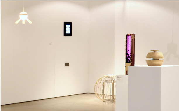
Figure 4. Figure Digital Bamboo Exhibition UNSW Art & Design