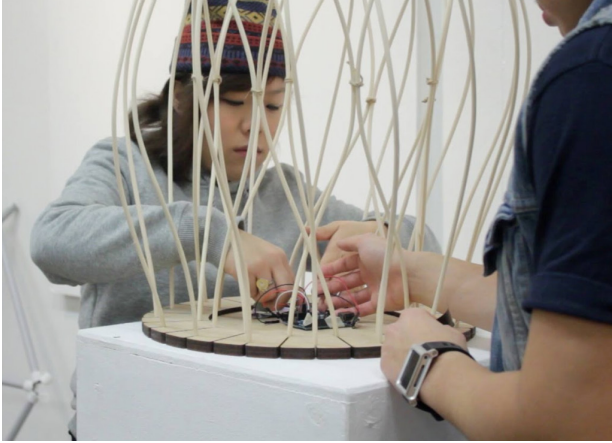
Figure 2. Fitting electronics to a prototype, Feral Experimental Workshop, UNSW.

The final Digital Bamboo Studio , a 2 week intensive course at ITB Indonesia during September 2014, redirected the challenge, asking students to conceive furniture, lighting and related objects that engaged Indonesian people at a personal and interpersonal level. Informed by field trips and intensive workshops, the students worked small teams, responding to the theme of 'security' - what it meant for Indonesians and Australians in 2014. Their designs needed to employ components and processes appropriate to village bamboo craft, plus digital visualisation, 3D printing and laser cutting services available in Bandung. Three types of bamboo craft specialisations of the Tasikmalayan area were introduced : soft, delicate weaving used for flexible structures, bamboo bending methods used to create utensils and bird cages, and the more rigid common weaving used for containers and walls. Designs were to be hand assembled and could utilise open source physical computing code and electronic components. Students were asked to focus on developing objects that materially expressed functional and aesthetic narratives framed by their own cultural and technical exchange.