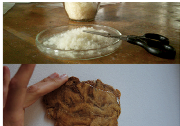
Figure 4. Cutting and arranging wool fibers

The second phase of experimentation ends with a series of iterations and creation of samples made adding and subtracting wool fibers to the mix of glycerol and starch and cooking them in a conventional oven. By analyzing the different samples, the first classification of possible material directions for further development started to arise (figure 5).