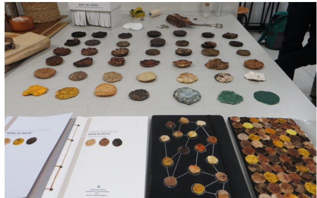
Figure 1. DIY Materials Course at Politecnico di Milano

We observed that through this kind of perpetual tinkering the students started to establish an emotional bonding with the materials they self-produced (Rognoli et al. 2016).