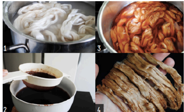
Figure 3. Cooking wool with different pigments

The second phase of experimentation ends with a series of iterations and creation of samples made adding and subtracting wool fibers to the mix of glycerol and starch and cooking them in a conventional oven. By analyzing the different samples, the first classification of possible material directions for further development started to arise (figure 5).