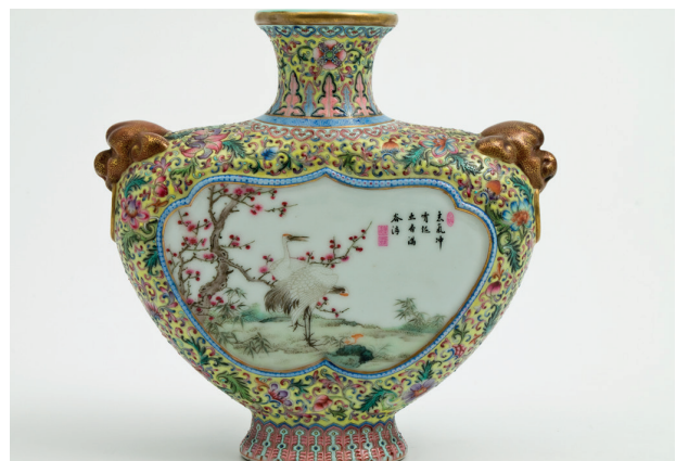
Vase, porcelain, Jingdezhen, c.1920-30, seals of Lang Shining