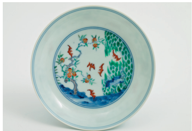
Dish, porcelain with doucai enamels, Yongzheng mark and period (1723-35)