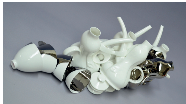
Jiang Yanze, Assemblage – 6, 2007, bone china © Jiang Yanze, now in the collection of The Potteries Museum & Art Gallery, Stoke-on-Trent

The eightieth vase was made at Royal Crown Derby and hand decorated with real gold leaf taking twenty-one days to make (as long as the Chinese-made vases) and it cost more. Twomey chose to use Chinese examples to raise questions about value and skill in a global society. Robert Dawson's Willow Pattern for Wedgwood (2005) takes elements from the iconic design based on Chinese patterns and uses digital technology to distort, blur, and make us look again.