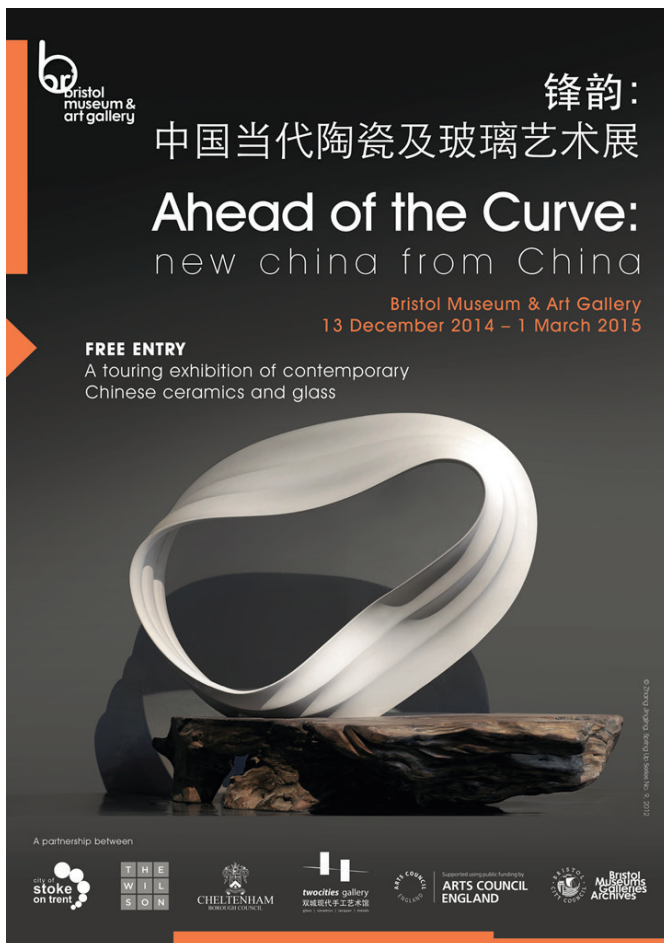
Exhibition poster for Ahead of the Curve exhibition at Bristol Museum & Art Gallery