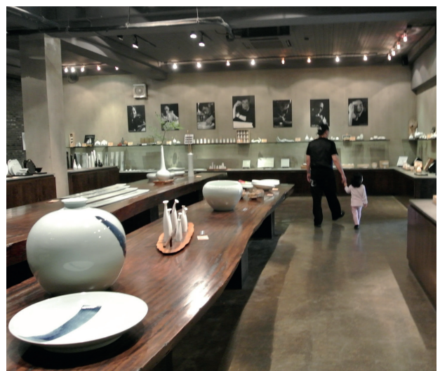
Spin Ceramics, Shanghai, 2012