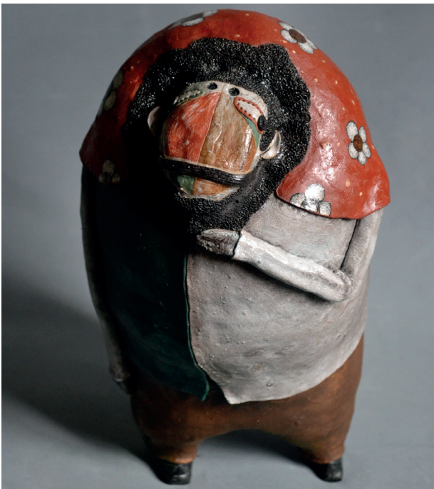
Wang Xiao, The Road series, 2013 © Wang Xiao

A number of makers explore the place of the individual in society. Among these is Shao Changzong (b.1981) who teaches at Jingdezhen Ceramic Institute. He uses traditional Chinese ceramic decoration (under-glaze blue or fencai enamels) which draws on historic designs in his large-scale figures. These are sometimes totally featureless, sometimes without mouths (only their eyes visible). The relationship between the figures and us and how they communicate is important, Changzong plays on their silence.