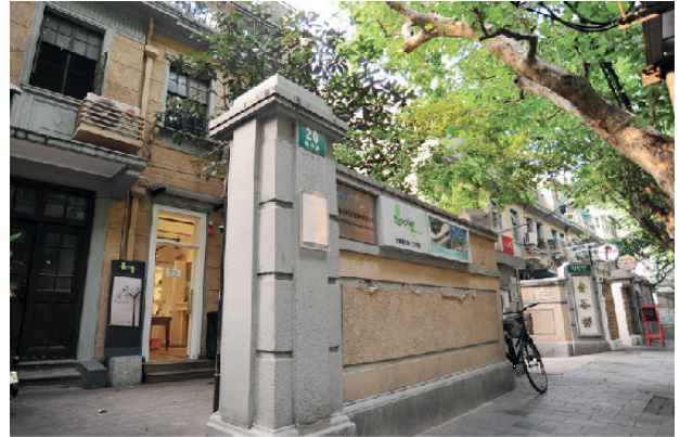
twocities gallery, Shaoxing Road, Shanghai, 2014

Our research visits, although short (between a week to ten days in each case) went some way to introducing us to the ceramics and glass scene in China. Personal introductions proved vital and we are grateful to many people who were generous in this regard including staff at the British Council offices in Beijing and Shanghai.