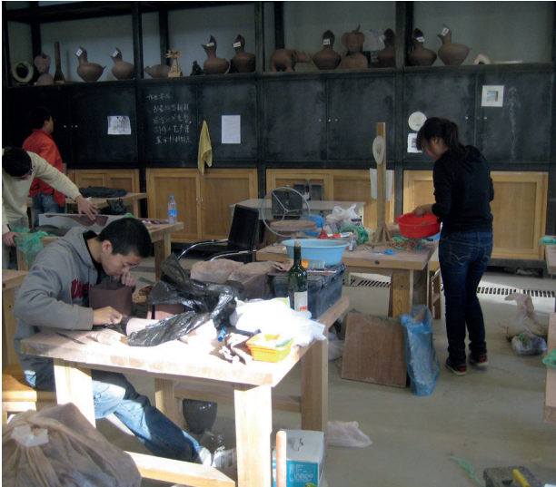
Ceramics Studio, Tsinghua University, Beijing, 2010

It goes without saying that these three institutions represent only a small proportion of Chinese universities offering ceramics and glass courses. China is so vast with such a large number of artists and craftspeople that it would be impossible to claim that the works we selected are representative of current Chinese studio ceramics and glass. There are currently about thirty Chinese universities offering Bachelor's degrees in ceramics with a further 100-150 that offer ceramics as an elective part of an art course iii . The Jingdezhen Ceramic Institute is one of the best known and has about 1700 students of ceramics at any one time iv .