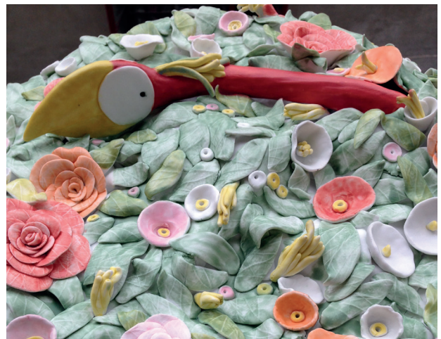
Shelly Xue, Gather Series – Angel is Waiting 11, glass, 2014 © Shelly Xue