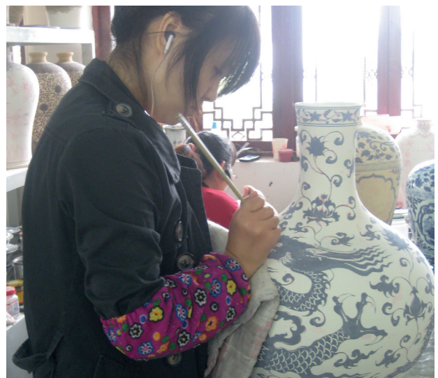
Worker at the Jiayang Porcelain Company, Jingdezhen, 2010