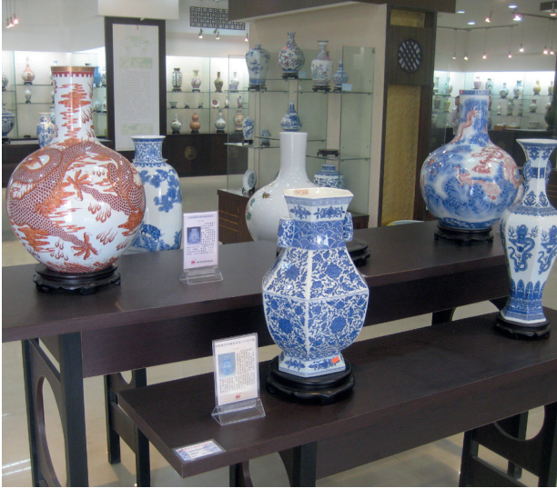
Showroom of the Jiayang Porcelain Company, Jingdezhen, 2010

In Jingdezhen we were able to see a range of ceramics being made and marketed. The city is well-known for its substantial production of and trade in reproductions of earlier Chinese ceramics, particular imperial wares. Businesses such as Jiayang Porcelain Company in Jingdezhen, co-founded by Huang Yunpeng, make high quality, hand-painted copies of historic ceramics. Workers at Jiayang take care to match historical styles and colours, for example appropriate shades of cobalt blue are used on reproductions that imitate Yuan (AD 1279-1368), Ming and Qing dynasty wares vi .