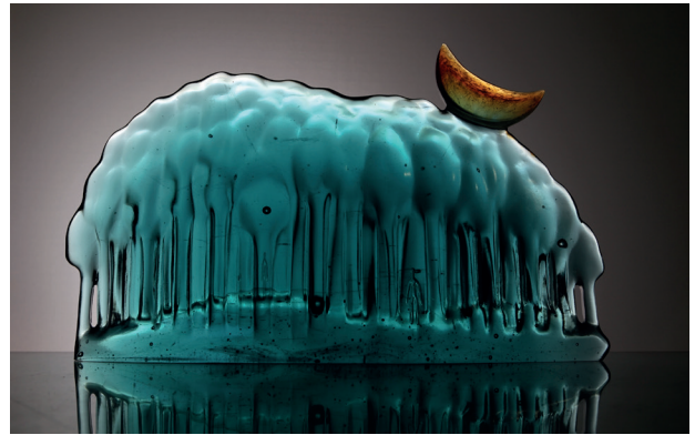
Han Xi, Lost, 2010 © Han Xi, now in the collection of Bristol Museum & Art Gallery

Wang Xiao (b.1988) is a much less established maker and the youngest in the exhibition. After training at Jingdezhen Ceramic Institute he was invited for a one-year residency at the Pottery Workshop in Jingdezhen as part of its programme of support for young potters. When we first saw his work in 2012 it reflected the inspiration of science fiction and Japanese manga with often strongly personal elements, images of himself and friends in imaginary landscapes. His works The Road made in 2014 for Ahead of the curve are more subtly and finely crafted combining detailed textural work with delicate hand building to create figures, half human half otherworldly. Do they represent migrant workers living their lives on the roadside or are they more generic symbolic figures?