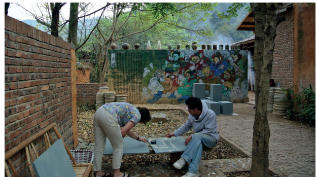
Sanbao Ceramic Art Institute 2012