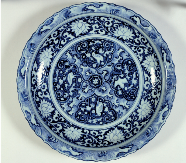
Dish, porcelain with under-glaze blue design, Yuan dynasty (1280-1344)