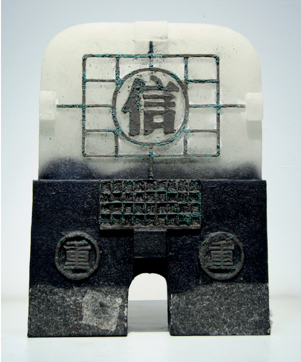
Guan Donghai, City Gate series, Xin, 2009, cast glass © Guan Donghai