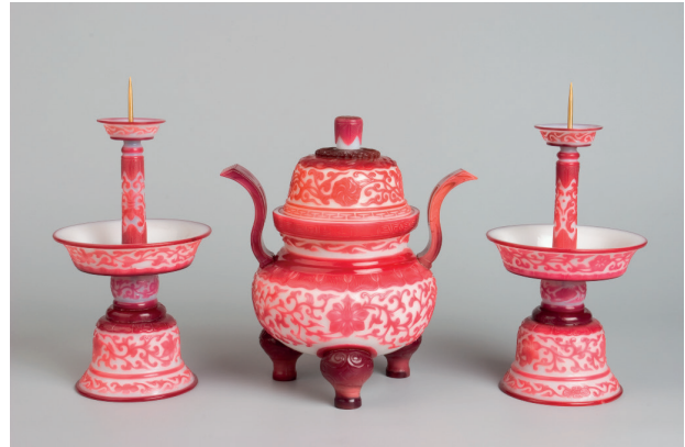
Glass altar set, Qianlong mark and period (1735-95), bequest of H.R. Burrows Abbey through The Art Fund, 1950