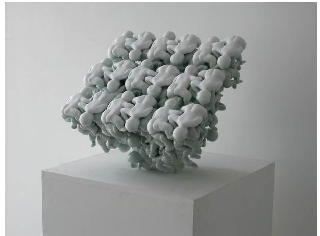
Xu Hongbo, Clones – position , 2007, porcelain © Xu Hongbo

In the 1990s Wan Liya (b.1963) was one of the first generation to establish his own ceramic studio, having previously trained as a navigator. In Birds Twitter and Fragrance of Flowers an installation of plastic coffee cups, cleaning product containers and coke cans, he comments literally on a throwaway society whilst making his objects in porcelain hand-painted with ‘famille rose’ designs that might have appeared on Imperial 18th century ceramics.