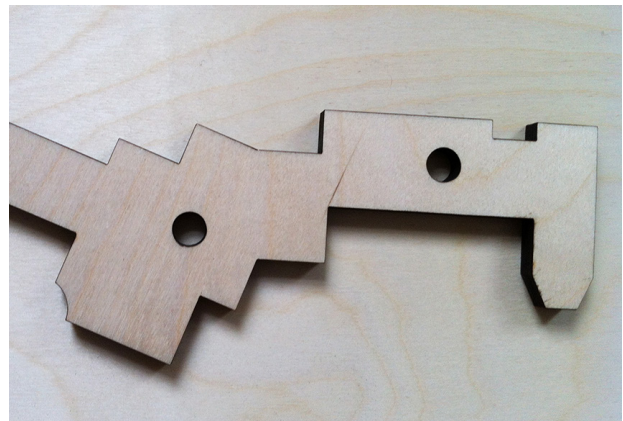
Things-meanings 1: plywood laser cut 'ground plan'