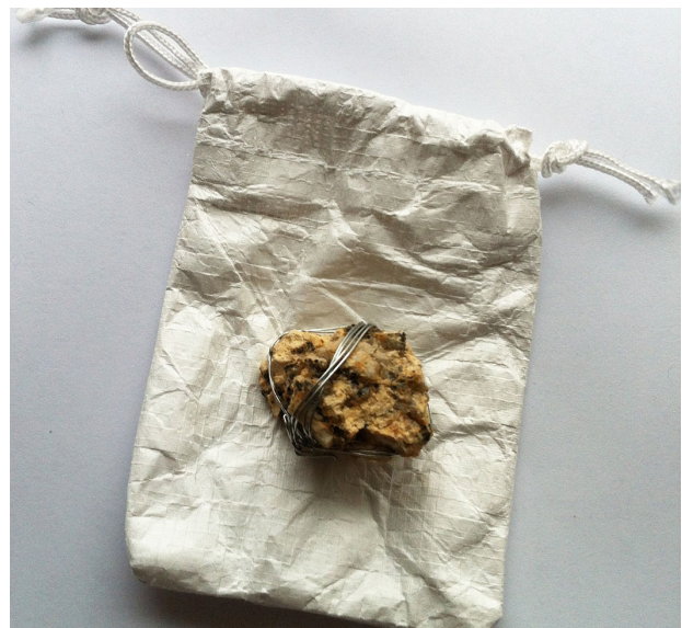
Things-meanings 7: granite & tyvek bag