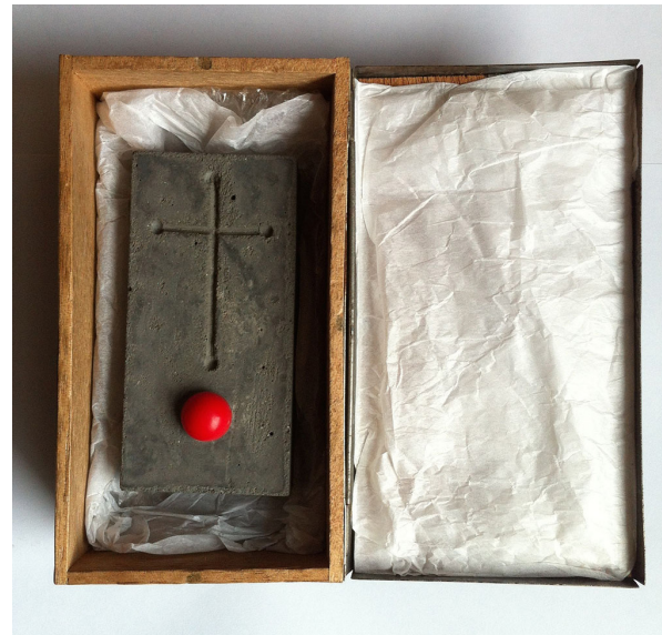
Things-meanings 6: miniature red 'billiards ball'

They scratch and mark the visitors hand; in their roughness they prod the visitor to remember the original raw material from which the castle has been built, to acknowledge its mass, power and vibrancy; both independent from and essential to Castle Drogo's symbolic structure.