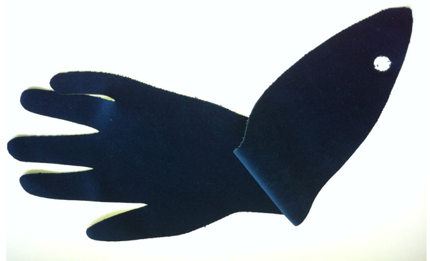
Things-meanings 3: blue velvet 'fish glove'

These objects were intended as offers of dialogic engagement to their human carriers; evoking contradictions and tensions around the intentions and constructions at Drogo, provoking symbolic connections and contemplations, but also directly affecting the visitor: chilling their hand, temporarily marking, inviting stroking, weighing heavily into the flesh of the palm, obliging a taking of responsibility for their care. To give detail and focus to the visitors' connection with the objects, and to facilitate the 'simple nuts and bolts' of the collection and return of the objects, we provided each visitor with a map consisting of an account of each object and a route; rather than provide this at the beginning of the route they were to pick up these maps a short way into the tour, so that for the first part of the tour they had only the first, second and third objects (and two simple instructions, one from a volunteer, and then another from a text by thing-meaning two) to guide them.