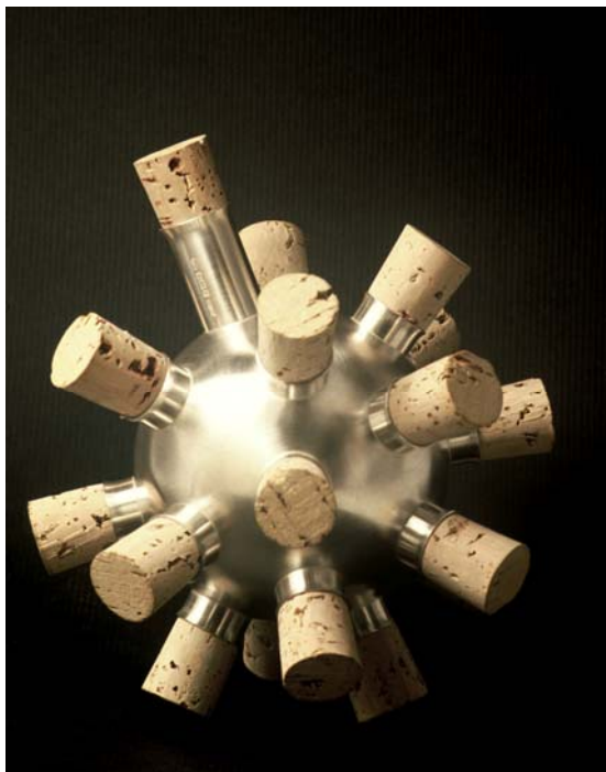
III. 1: Chris Knight. 1994. Corked Flask.

The issue of integrity in the crafts concerns the relation between material use, choice and application of process, the function and aesthetic of the object, and also its concept. In the development of a craft object, these five parameters will be developed in interdependence with each other in order to achieve an appropriate use of materials and process in relation to the final form and concept of the object. A good example seems Chris Knight's 'Corked Flask' (Illustration 1) where function and aesthetic come together, supported by the choice of materials (silver and corks) to convey the concept, which subverts our expectations of what a flask is like, and at the same time invokes humorous reflections of social drinking habits and rituals.