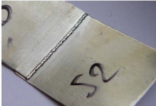
Example 1: welding two sheets over edge