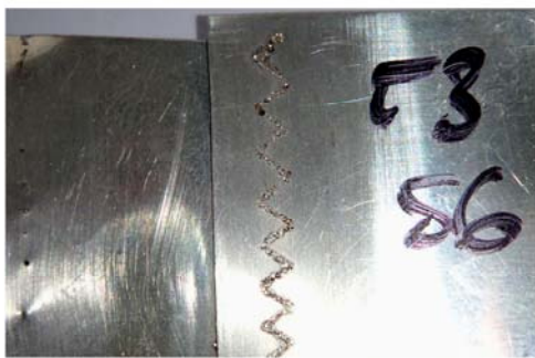
Example 2b: Welding two sheets flat (zigzag)