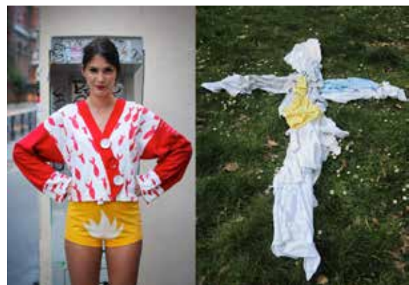
Left: jackets and shorts made from recycled second-hand T-shirts, 'The Wasteland' collection; Photo: © Maison Briz Vegas, 2012.

a useful amount of base fabric. The recycling and design work of Maison Briz Vegas demonstrates the material potential of the post-consumer waste of second-hand T-shirts.