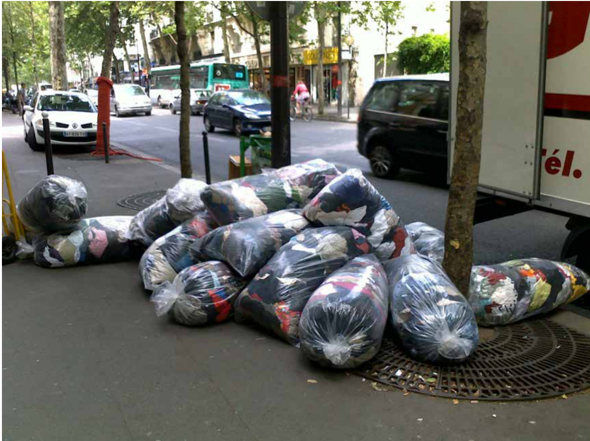
Discarded clothing being delivered to a second-hand store in Paris

Within the realm of second-hand clothing, basic items such as T-shirts are barely valued, especially when a new mass-produced T-shirt can be bought for close to the same price as a used one. T-shirts are not a luxury fashion item; generally they are banal, ubiquitous and far from exclusive. However, if we are to reinstate value to the aspects of clothing production that fast-fashion has devalued, perhaps the status of second-hand and mass-produced T-shirts should be reconsidered.