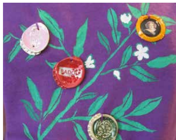
Bottle-top embellishment, 'The Glam and The Gloom' collection, Maison Briz Vegas, 2012.

Other examples of surface decoration employed by Maison Briz Vegas include embroidery and appliqué. Garments are constructed with seams often left raw. Fastenings are simple ties or buttons – things that can be made from the same fabric or waste items. Finishing touches and embellishments are often created from rubbish, for example, thread made from plastic bags is used to embroider, bottle tops become buttons and sequins are cut from plastic bottles.