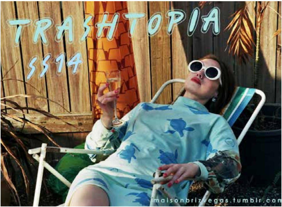
'Trashtopia' postcards.