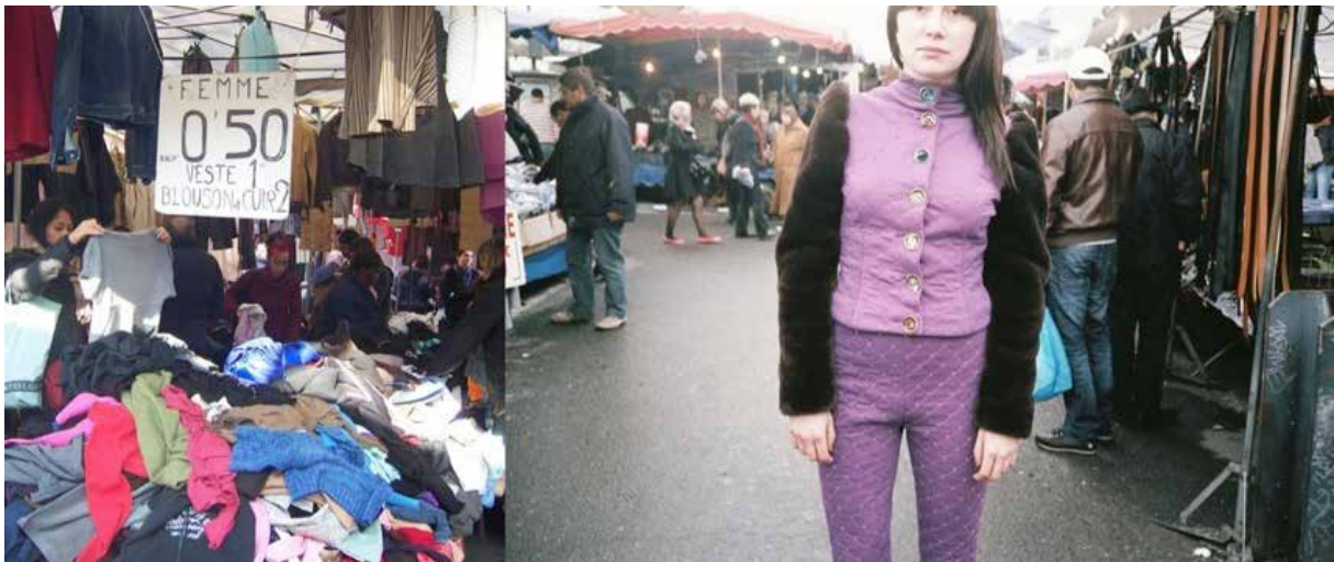
Left: Paris flea market; right: quilted jacket and pants from 'The Glam and The Gloom' collection.

The second collection, a winter collection titled 'The Glam and The Gloom' was created from second-hand T-shirts and jumpers. From the gloom of mountains of discarded clothes piled high at the flea markets, Binotto and van Lunn worked to create new and precious clothes with a touch of glam, or magic. Old woollen jumpers were abundant at the flea markets during those winter months and, like cotton T-shirts, provided a valuable textile resource. As in the first collection, the used garments were washed, dyed and unpicked. Jumpers were patched together or quilted between T-shirt jersey to create new fabric. Some features of the original jumpers, such as pockets, buttons, or ribbing were incorporated into the new garment designs.