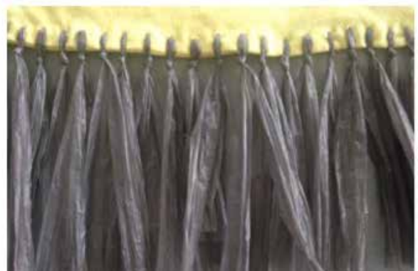
Left: beach cape, 'Trashtopia' collection; top right: beach cape print detail; bottom right: plastic bag fringe detail.