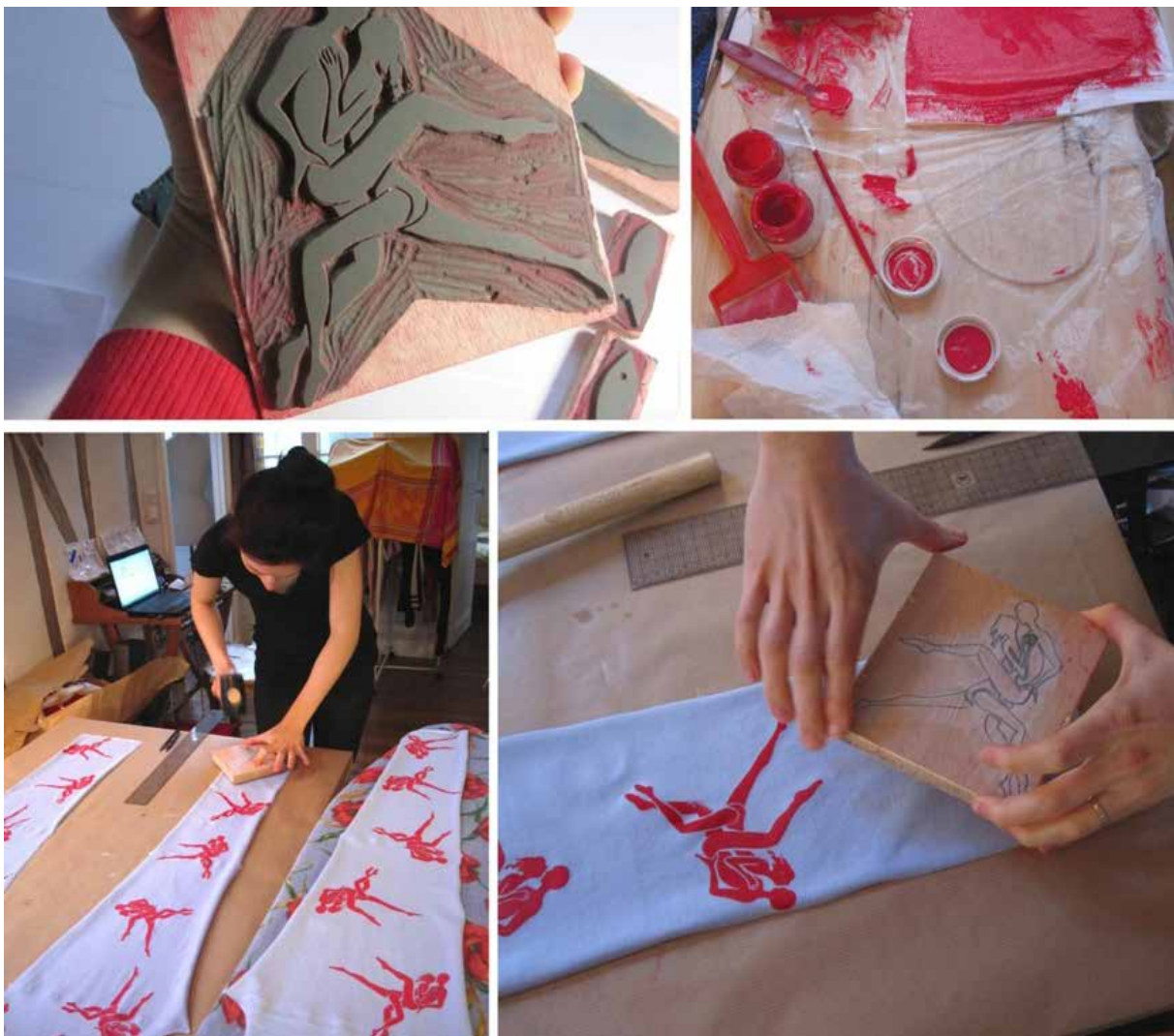
Block-printing process, 'The Wasteland' collection.