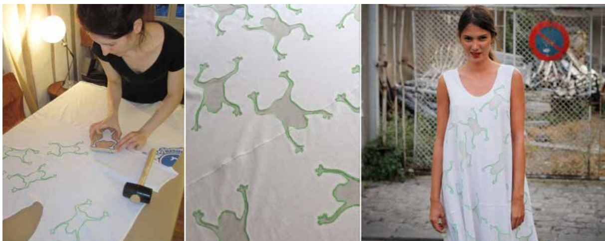
Left: block-printing; centre: reverse appliqué and print detail; right: dress from 'The Wasteland' collection.