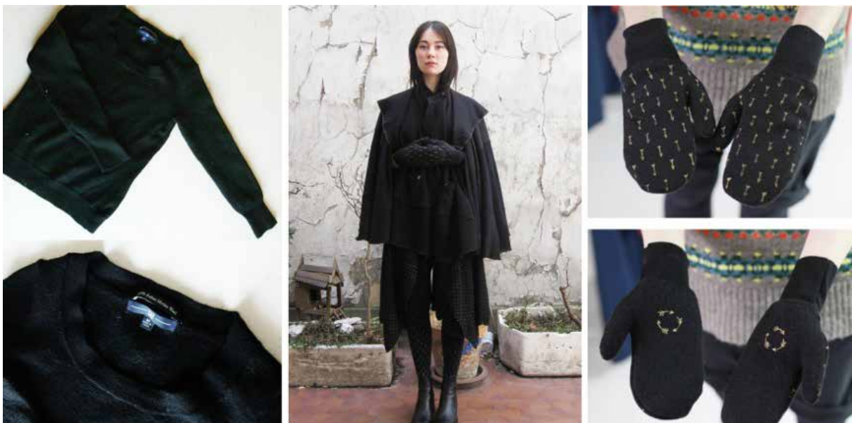
Left: old jumpers; centre: cape, dress, tights, and gloves from 'The Glam and the Gloom' collection. Right: gloves made from jumper fabric, hand printed.