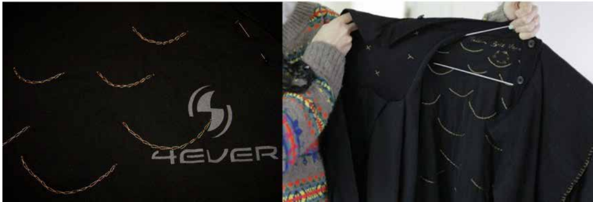
Embroidery detail on cape, 'The Glam and The Gloom' collection.

The designers developed original prints and printed the fabrics using linoleum blocks and stencils they had cut themselves. Old bottle tops and champagne caps were embellished with beads and used as buttons. Hand-stitching and embroidery were used throughout to finely finish or decorate the garments. Metallic embroidery thread was used to add a touch of luxe to the recycled textiles (see Figure 10). These sorts of artisanal craft techniques demonstrated the great potential for upcycling of old poor materials. Quilting multiple layers of old materials together created warmth and structure in the new garments.