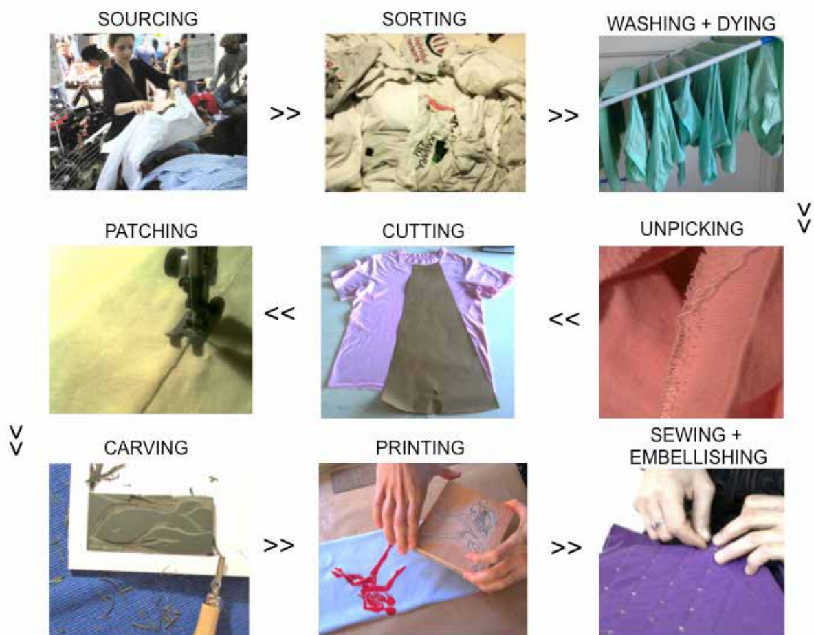
Maison Briz Vegas stages of production.

Sourcing the second-hand T-shirts and other specific clothing items involves regularly visiting flea markets and second-hand stores and rummaging through piles and racks. This activity is the opposite to conventional industry practice where designers normally visit large international textile tradeshows to source from the next trends in colour and texture, or from the latest in textile technology.