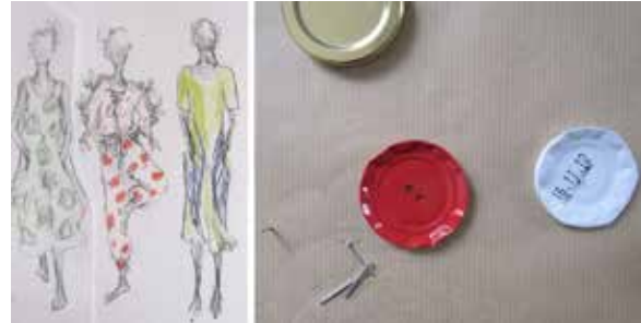
Left: sketches of 'The Wasteland' collection; right: buttons made from old jar lids.

to communicate the provenance of the fabric. Garments were hand-finished and some edges left raw. The collection was designed to feel simple and fresh in spirit.