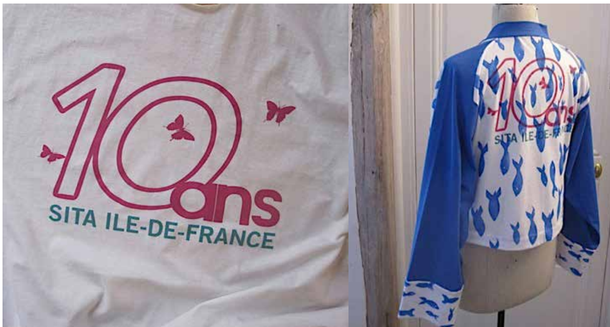
Logo featured in a jacket from 'The Wastelands' collection, Maison Briz Vegas, 2011.

The T-shirt fabric is utilised according to the size of the pattern pieces from which the new garment will be constructed. Small pattern pieces may be arranged and cut from the fabric of individual T-shirts while larger pattern pieces may require the fabric of multiple T-shirts to be patched together. The fabric is patched by overlapping raw edges and sewing them together using a zigzag stitch, a decorative, elastic stitch that is more common in domestic sewing than industrial sportswear or high-end garments. These zig-zag joins have become part of the Maison Briz Vegas branding, a symbol of the slower and eccentric making process.