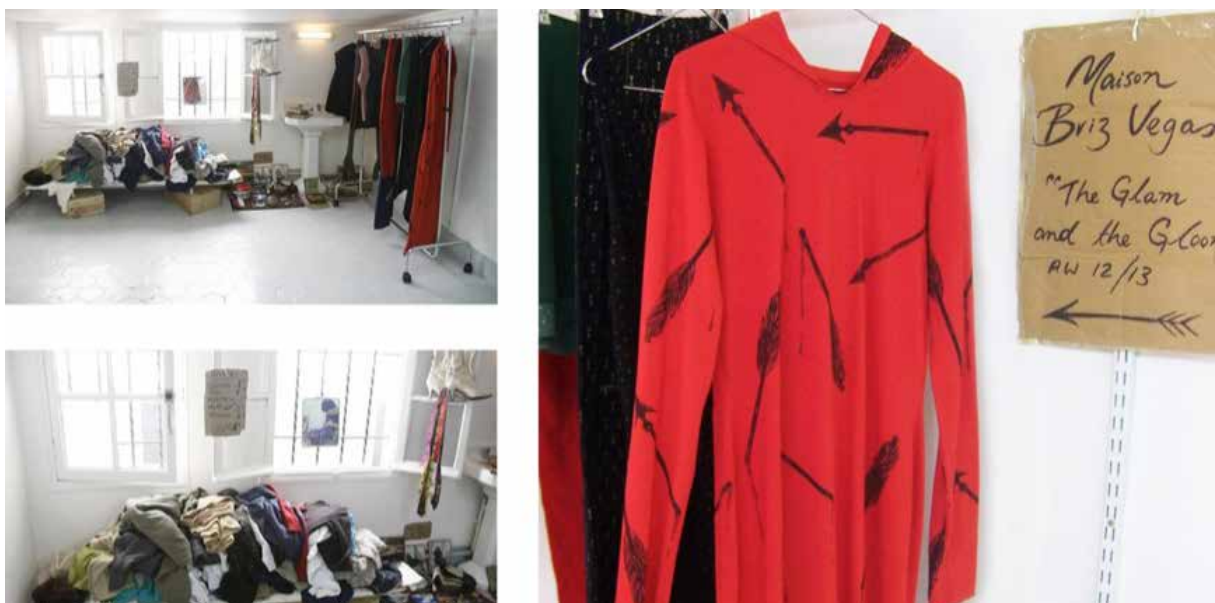
Presentation of 'The Glam and The Gloom' collection, Paris showroom 2012.

'The Glam and The Gloom' collection was presented once again in the same showroom in Paris and this time the designers created a tableau of a flea market to display their new designs. Their installation was put together using garments, bric-a-brac and rubbish collected from the real markets. Even the weathered pieces of cardboard and string used to fashion the price signs were authentic. Bringing dirty old items and junk from the fringes of Paris into a clean, slick designer showroom in the heart of the city was an effective act of activism within the fashion system. It amused buyers and press while giving them an insight into the inspiration for the collection and the source of the original garments used to create it. This prompted interest into how the clothes were actually made, an aspect commonly overshadowed by the look, feel and fit of the end product. The designs and the concept were once again highly appreciated but Binotto and van Lunn decided once again not to wholesale their work. They returned to Australia to continue their research and develop a business model.