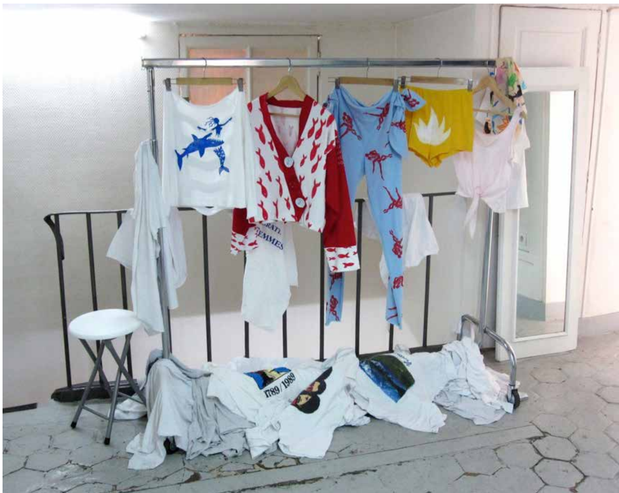
'The Wasteland' collection, Paris showroom, 2011.

horrified by the use of T-shirt fabric and relegated the collection to a small space of floor next to a staircase. Van Lunn created a small installation to portray the recycling concept, presenting her new designs on a rail above a pile of dirty T-shirts from the flea markets. Despite the agent's best efforts to avert the gaze of buyers and press, the recycled pieces and the display drew significant attention and commercial interest. Alongside luxurious collections made from silks and wools, the recycled collection was seen as interesting and desirable in its own right in this high-end context. Buyers and press were impressed by the concept, designs and print work, and wanted to see more pieces the following season.